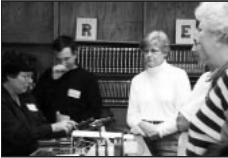
Teachers learn about new science units designed to develop students' awareness of the potential of alternative energy sources.