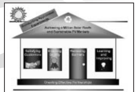
Key elements of the Florida PV Buildings Program.