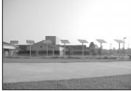
This PV system was recently installed by municipal utility JEA at First Coast High School in Jacksonville.

Eight PV system installation training courses and examinations have been offered, and over fifty installers have been authorized to participate in the Florida buy-down program.