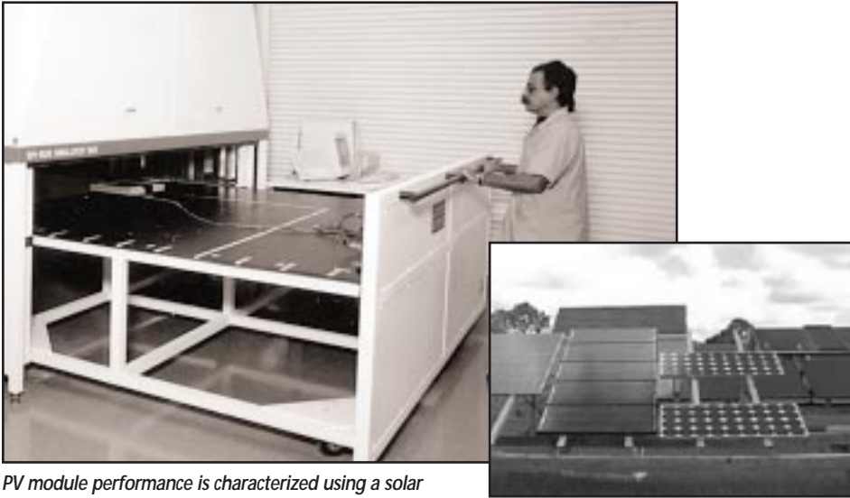
PV module performance is characterized using a solar simulator and outdoor tests.

The requirement that systems undergo a design review creates an incentive for suppliers to provide better documentation of their products, which often has been inadequate in the past. Poor documentation of designs invariably leads to problems over time. The Siemens earthsafe™ systems were the first to be reviewed and approved by FSEC. Others are now under review.