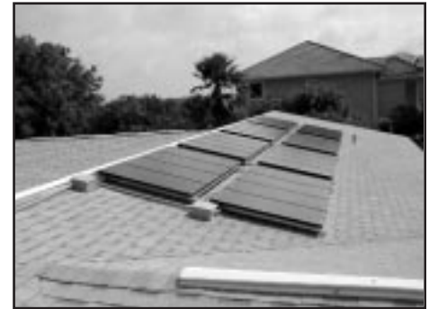
The Utilities Commission of New Smyrna Beach installed and will maintain this customer-owned residential system.

The Utilities Commission of New Smyrna Beach (UCNSB) was one of the first municipal utilities to commit to a large-scale solar project: 150 kW of PV on at least 60 public and private buildings over the next four years. UCNSB has allocated $645,278 to the project, with the difference being paid for through green pricing and $100,000 in buy-down funds from FSEC. Through their Renewable Rooftops program, customers may opt to pay a public building contribution (a $5 or $10 premium on their monthly bills), or choose private ownership (purchase a PV system for $1.82 per Watt – the lowest price in the country). All of the systems will be net metered, and UCNSB offers free installation and service of the system as well as low-interest financing over five years. UCNSB has installed about 8 kW of PV and expects to complete another 23 kW of installations by the end of this year.