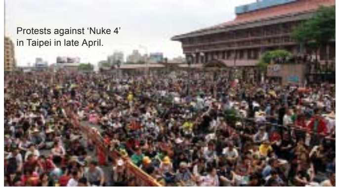
Protests against 'Nuke 4' in Taipei in late April.

or with a minimum 25% turnout. The KMT opposes those proposals but may have to modify its position given the strength of public and political opposition.