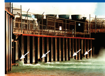
Water discharge area at a nuclear power plant on Lake Michigan. Note the flow from four big ejection outlets.

Radioactive gaseous and liquid releases to air, water and soil from nuclear power plants include: